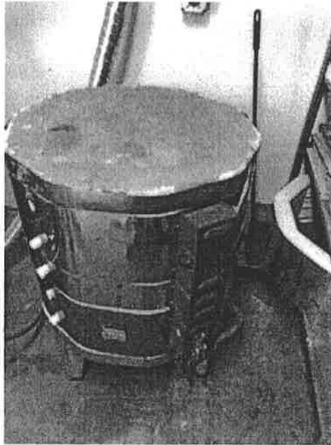
Skutt Electric Kiln Model 231 Serial 10948